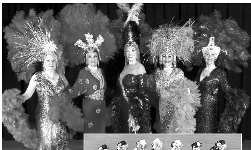
Original Florida Follies

returns to the Parker Playhouse on Sunday, February 8th starting at 1:45 p.m.. Their two-hour, high energy Broadway style stage extravaganzas, "That's Entertainment 2009", feature performers who are between 60 and 90+ years young. This dance troupe is made up of retired show girls, dance teachers, choreographers and others who love to dance. Plenty of dancing, comedy and a salute to Broadway and opera. "The Follies Precious Gems," features ladies 80 to 92 years young. Tickets are only $28.00 with group rates available.